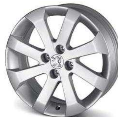
Abellia 17" wheel

Increase ventilation into the cabin area whilst minimising wind noise and buffeting