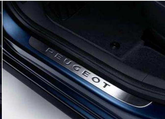
Stainless steel door sill protectors