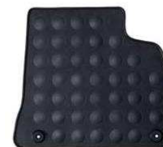
Rubber mat set