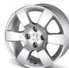
Eris 16" wheel