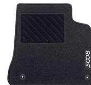
Standard carpet mat set