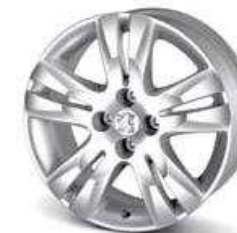
Quark 17" wheel