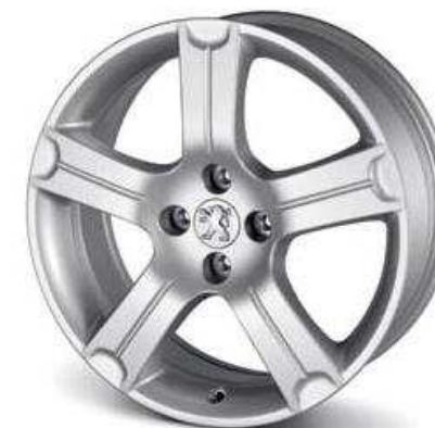
Cereus 18" wheel