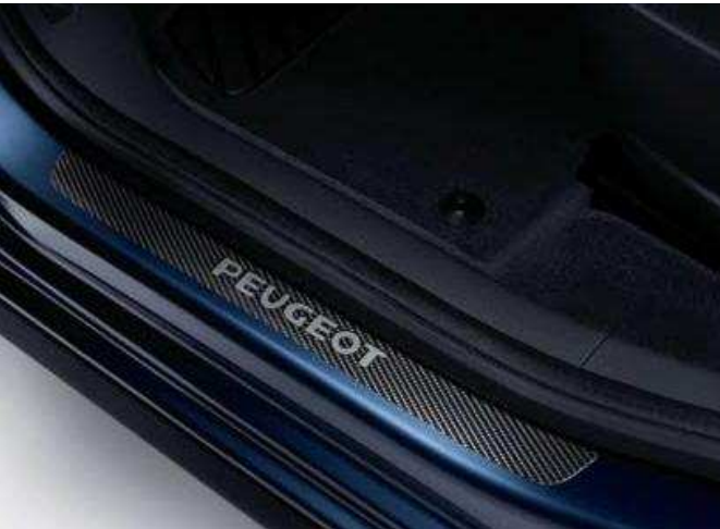
Carbon fibre effect door sill protectors

Your 5008 is an extension of your living space. Make it even more practical and comfortable with these specially designed accessories.