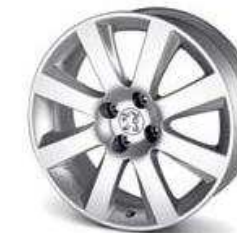
Magnetik 18" wheel