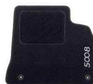
Velour carpet mat set

prevent interference with the vehicle pedals the driver's side mat clips onto the existing fixings.